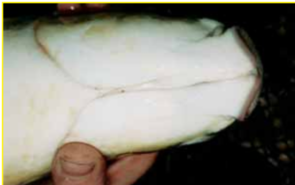
Underside of grey mullet head