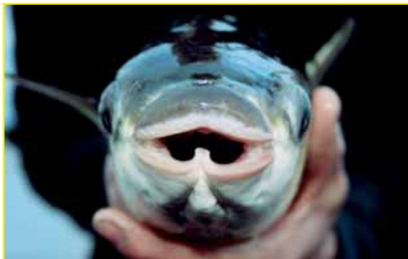
Head on photograph of grey mullet showing lips