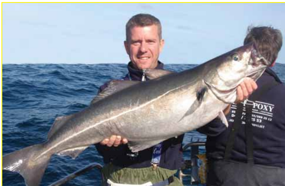
Another Courtmacsherry Coalfish!