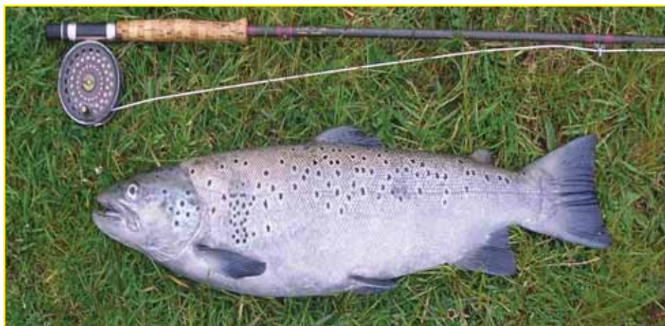
Arthur White caught this sea trout in May