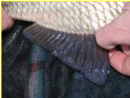
Roach Bream Hybrid