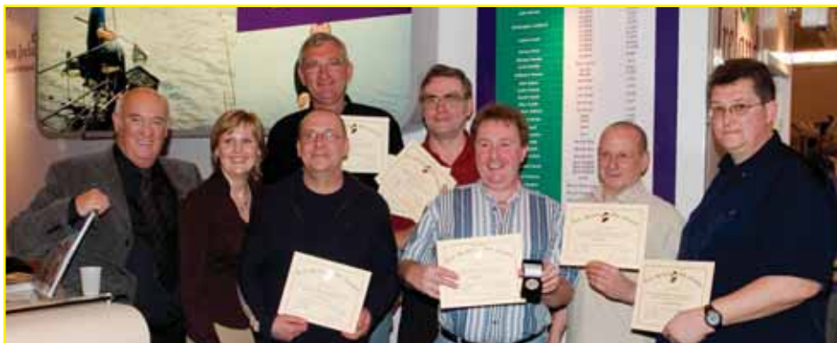
Some of the UK anglers who received specimen awards at the NEC in Birmingham at the Fáilte Ireland hosted ISFC presentation of awards