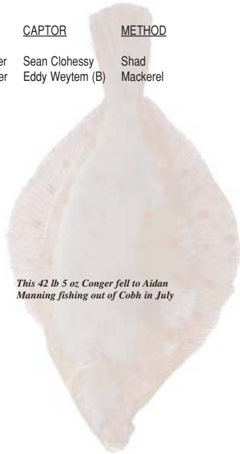
This 42 lb 5 oz Conger fell to Aidan Manning fishing out of Cobh in July