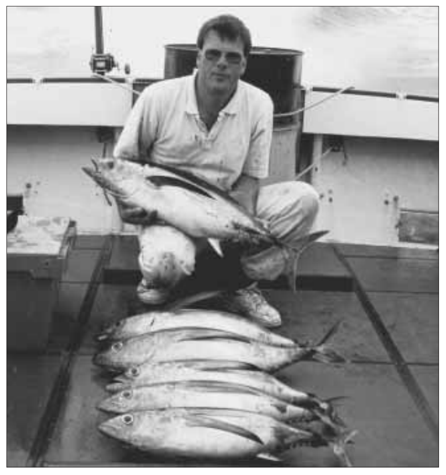
The journey home with six tuna ranging from 12 to 25 lbs in weight

Although blue fin are listed on the Irish Specimen Fish Committee's marine list, the other species like tuna, sailfish and swordfish are not. Who will be the first angler to set up a new class?