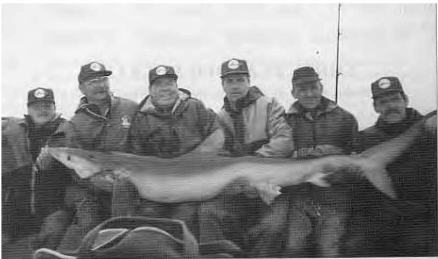
A Dutch party with a 112 lbs. Blue Shark in Sheephaven Bay.