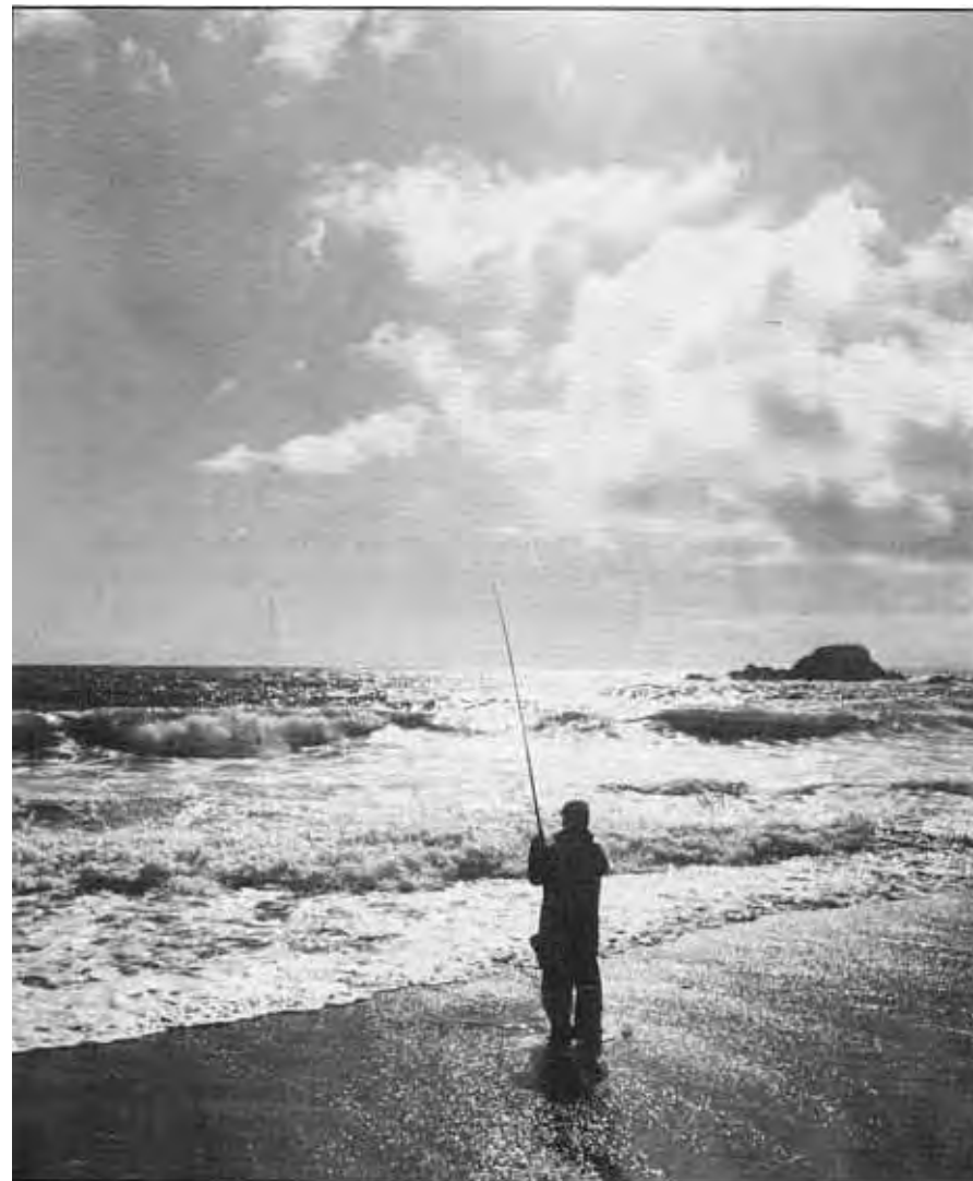
Surf fishing on Owenahincha Strand, Co. Cork.

Entry forms and/or I.G.F.A. International Angling Rules and World Record Requirements may be obtained from I.G.F.A., 300 East Las Olas Boulevard, Fort Lauderdale, Florida, 33316-1616, U.S.A.