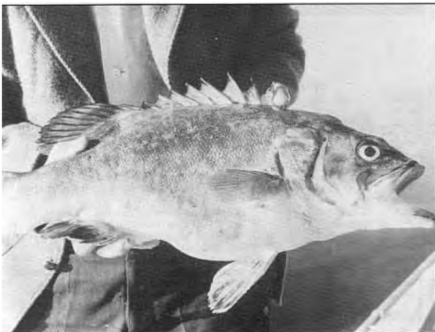
A rare wreck fish or stone basse from Valentia. The summer of 1990 produced large numbers of "tropicals" including triggerfish, amberjack, mako shark and pilot fish.