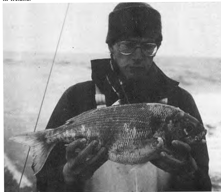
A beautiful 6 lbs. specimen Red Sea Bream – a species much sought after by Dutch anglers.

If we look a little closer from the sea angling point of view, Ireland has a number of aspects which, in my opinion, are very appealing to us Dutch. The number of species regularly taken on the Irish Coast, for example. In the Netherlands, a sea angler can only catch one or, at the most, two sea species during a days fishing, while in Ireland, it is not unusual to catch more than ten species in a day at sea. Then there is the size. In the Netherlands, most of the time the sea angler has to be content with a whiting of a ½ Kg, or a cod of maybe 2 Kgs. In Ireland, on the other hand, this is not quite the case. It is not unusual to catch a great number of species which weigh much more than 5 Kgs. And of course in Ireland, it is possible to catch a number of what, to us Dutch anglers, are "exotic" species. The Blue Shark in particular was, and remains, a species which attracts many Dutch anglers to fish in Ireland.