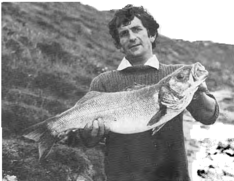
4 specimen Bass from Wexford. This species is not as plentiful as in the past and anglers are requested to return the smaller fish to the sea for conservation purposes.