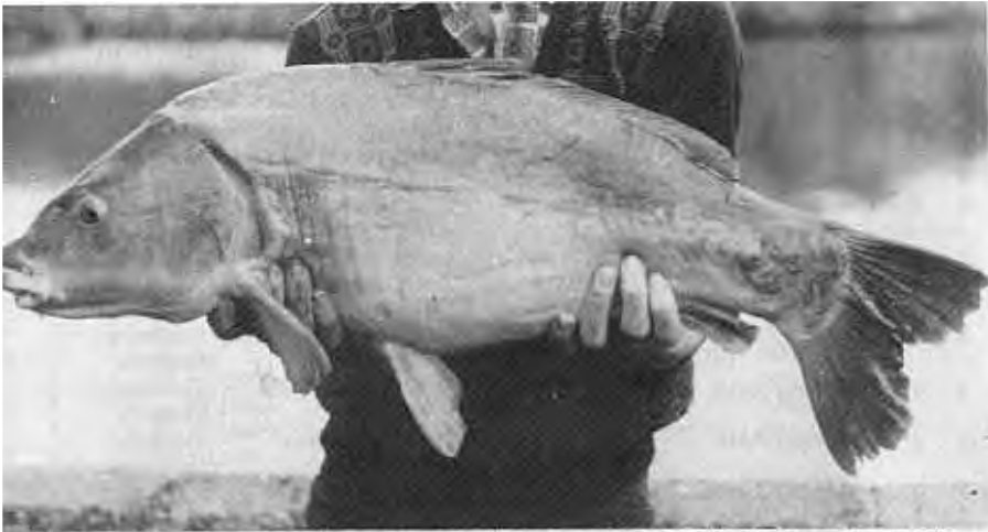
More specimen Carp have been caught in "The Lough", in Cork than any other water.