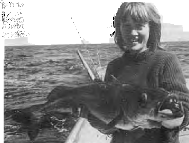
The Fastnet area is well known for its fine Pollack which abound on the deep water reefs.