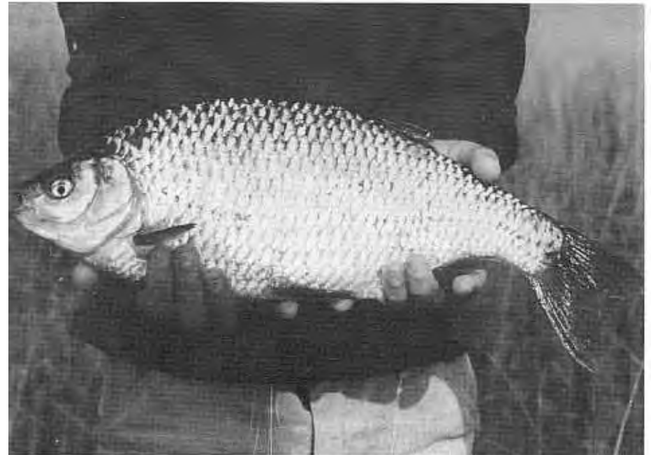
A specimen Rudd from Annaghmore Lake, Strokestown – one of the better big rudd waters in the country.