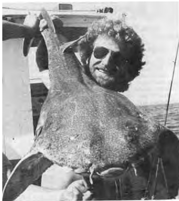
A fine Monkfish from Tralee Bay. Many of these fish have been tagged and released. Some have been recaptured three times.